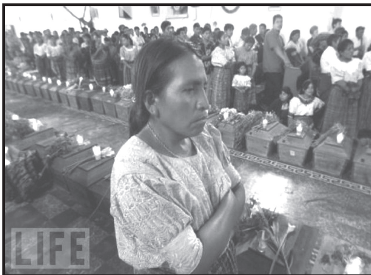
A Maya Indian woman takes part in the wake for the 100 massacred victims on 19 April 2002 in Zacualpa, Guatemala. The remains of 100 Maya Indians who had been bludgeoned, shot or hacked to death were laid to rest 20 years after Guatemala's bitter 1960-1996 civil war. According to the Guatemalan Anthropology Forensic Foundation, the cemeteries where the bodies were found are part of 669 that have been located in the area as a result of the violence.

Finally, the judgment refers to further prosecution proceedings that the public prosecutor shall institute, as names of two other allegedly involved military officials emerged during the trial.