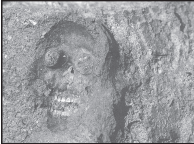
A human skull appears as if it were screaming. A total of 27 bodies were exhumed from clandestine sites in Chontala last summer. The exhumation was carried out with information gathered by Conavigua, an organization of widows of indigenous Guatemalans.

disappearance as a crime of particular gravity. The Government likewise undertook to support recognition in the international community of the definition of systematic enforced disappearances as a crime against humanity.