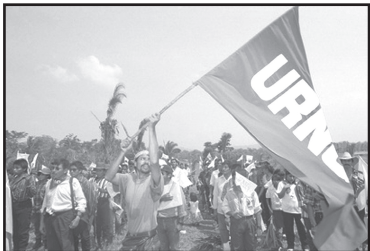
Members of the URNG await to receive their certificates after completing a “demobilization” process, where they have obtained skills which prepared them for a civilian life on 1 January 1997.

Nevertheless, for almost 30 years, the majority of reported cases of enforced disappearance during the armed conflict remained unsolved. 12 Since enforced disappearance was codified as a separate crime under domestic penal law in 1996, the mentioned provision remained dead letter for more than 10 years. In fact, until 2007, there was not a single person arrested or tried for the commission of the crime of enforced disappearance. Only two cases made their way up to the stage of formulating an accusation. The two cases referred to enforced disappearances which had occurred between 1981 and 1984. The defendants invoked the principle of non-retroactivity of criminal law and claimed that they could not be charged with the crime of enforced disappearance as Article 201-ter had been introduced in the Criminal Code only in 1996 that is many years