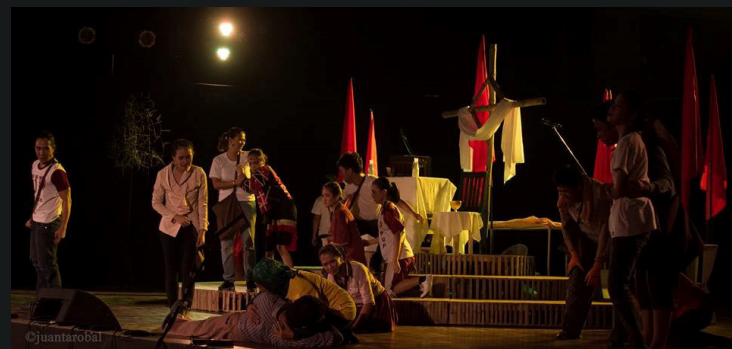
Pagsambang Bayan The Musical by the Tag-ani Performing Arts Society, directed by Joel Lamangan, various venue

Congratulations to the Asian Federation Against Involuntary Disappearances (AFAD) for having completed two decades of struggle for a world free from enforced disappearances!